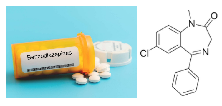
Figure 1 Structure of benzodiasepine

Benzodiazepine is a potent prescription medication that is most used to treat anxiety and panic disorders. It is also sometimes used to treat seizures and even alcohol withdrawal while in medical detox.